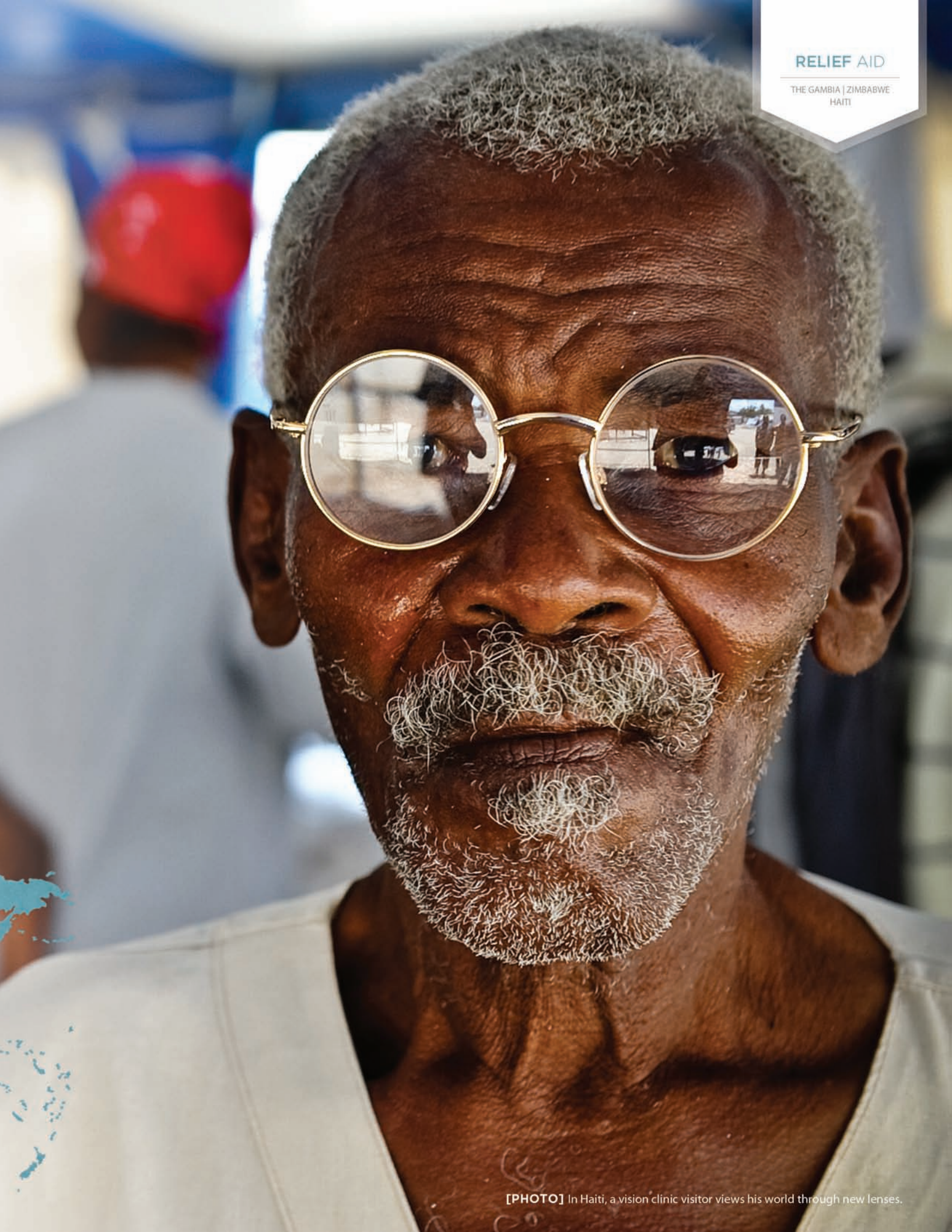
[PHOTO] In Haiti, a vision clinic visitor views his world through new lenses.